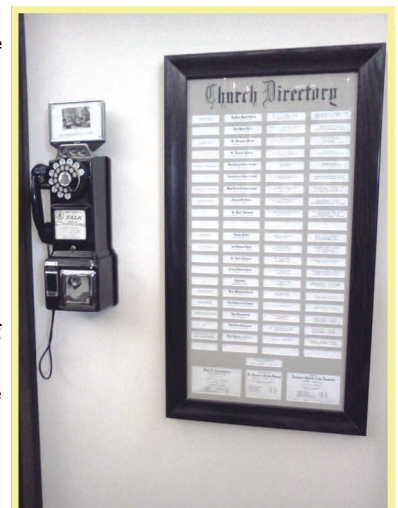
on June 8, 2013, Mayflower Manor, Akron, OH.

This is the phone and church directory Bill W. used to find another alcoholic when he had the choice to go the bar in the hotel or find another drunk like himself to help.