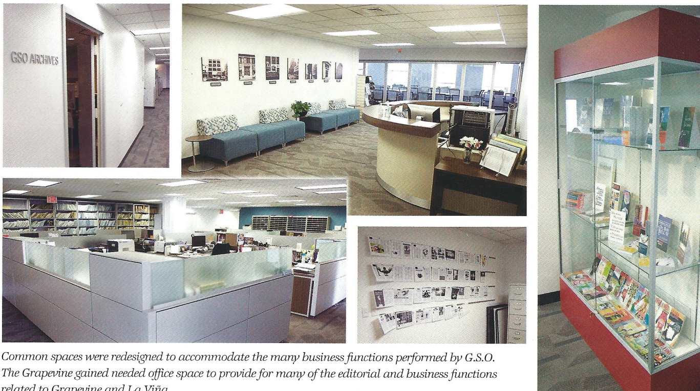
Common spaces were redesigned to accommodate the many business functions performed by G.S.O. The Grapevine gained needed office space to provide for many of the editorial and business functions related to Grapevine and La Viña.

Begun in August 2015, construction and renovation of the G.S.O. and Grapevine offices has been completed. Known as the Relocation Project, the renovation addressed existing needs for reconfiguration on the 11th floor and allowed enough office space for the Grapevine to move to the 11th floor from its previous space on the 12th floor. During the period of construction, tours of G.S.O. — and the Friday morning A.A. meeting — were suspended on a temporary basis, though they have now started up again, offering visiting A.A.s an opportunity to walk the hallways and learn more about their service office.