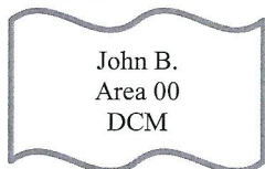
Sample Name tag

EMAIL: _____ (required for confirmation) PHONE#: _____